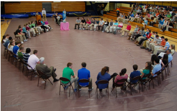
QND students and faculty participate in the Living Rosary.

With an enrollment of approximately 400 students, QND is a place where students and parents experience acceptance, communication, positive challenges, and a rich tradition of academic excellence and success in all extracurricular endeavors.