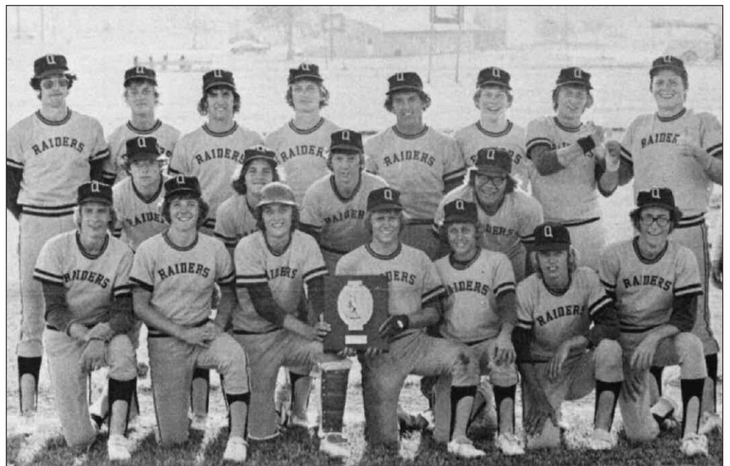
1975 Boys Baseball Team