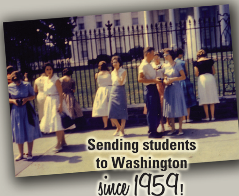
Sending students to Washington since 1959!

Create lasting memories and friendships during the week-long tour! Visit the Civil War Battlefield at Gettysburg, the National Cathedral, Smithsonian Museums, George Washington's home, Supreme Court, Arlington National Cemetery, the Holocaust Museum, among many other sites. Also, enjoy a special twilight Potomac River Boat Cruise.